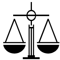
What is Justice?

Forensic is defined as, "evidence" or as "relating to, used in, or appropriate for courts of law." This minor looks at forensic issues from both psychological and criminal justice perspectives. The minor is suitable for criminal justice majors or any individual wishing to pursue a